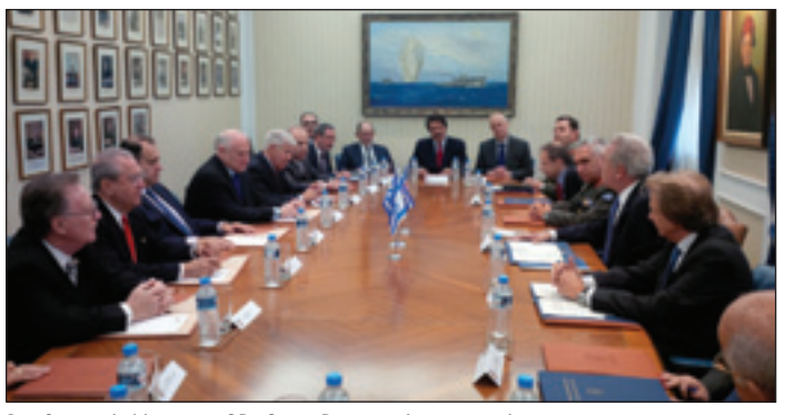
Briefing with Minister of Defense Dimitris Avramopoulos.

The final leg of the three-country visit was to Greece, Jan. 13 to 15, where the delegation met with: President of the Hellenic Republic Karolos Papoulias; Prime Minister Antonis Samaras; Minister of Defense DimitrisAvramopoulos; Speaker of Hellenic Parliament Evangelos Meimarakis; Minister of Tourism Olga Kefalogianni; Deputy Minister of Foreign Affairs Kyriakos Gerontopoulos; Minister of Culture and Sports Panos Panagiotopoulos; American Ambassador to Greece David Pearce; and Israeli Ambassador to Greece Arye Mekel.