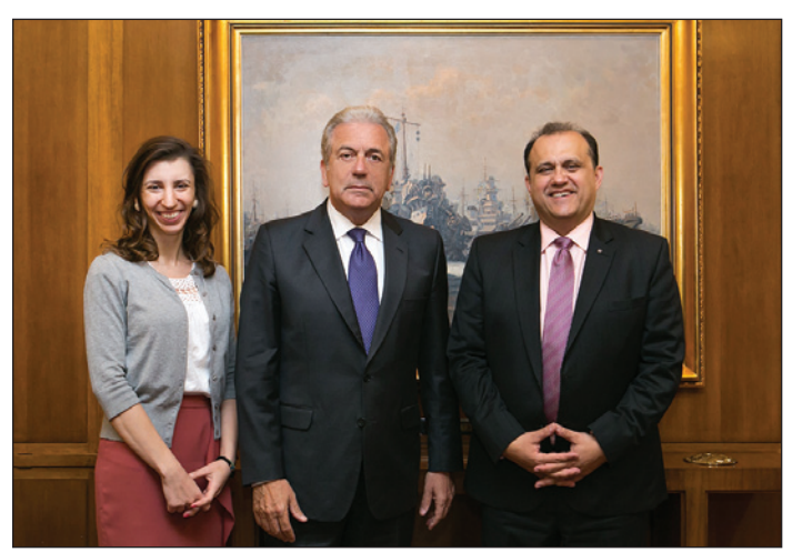
Meeting with Defense Minister Dimitris Avramopoulos.

Meetings with U.S. Ambassador to Greece David Pearce, Greece's Defense Minister Dimitris Avramopoulos, Deputy Foreign Minister Kyriakos Gerontopoulos and extensive briefings with foreign ministry officials, were highlights of the delegation's itinerary in Greece. The itinerary also included the 10th Annual AHI Athens Hellenic Heritage Achievement and National Public Service Awards Dinner at the Grand Bretagne Hotel on May 14, 2014.