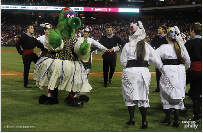
The Phanatic dancing in a foustanella with the Pegasus dance troupe of the Greek Orthodox Church of St. Demetrios in Upper Darby.

AHI sponsored a "Greek Heritage Night," held in cooperation with Major League Baseball's Philadelphia Phillies, May 28, 2014 at Citizens Bank Park, Philadelphia, Pa. It was a tremendous suc-