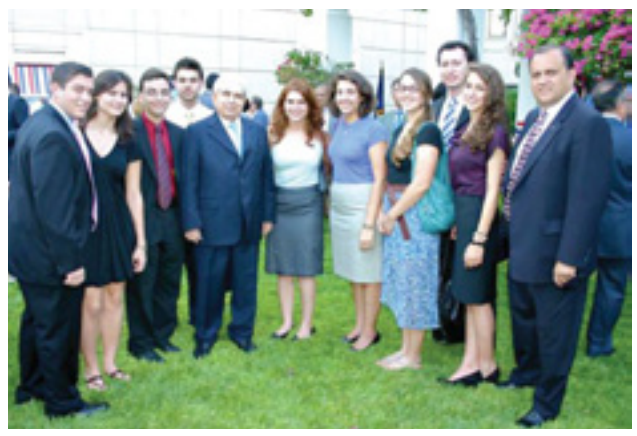
President of the Republic of Cyprus, Demetris Christofias with the students at the U.S. National Day reception at the U.S. Embassy in Cyprus.

The American Hellenic Institute Foundation (AHIF) Foreign Policy Trip to Greece and Cyprus completed its fourth year as nine students from across the United States participated in the two-week program held June 13-29, 2012.