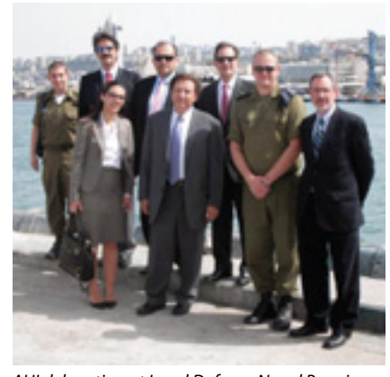
AHI delegation at Israel Defense Naval Base in Haifa.

An AHI delegation successfully completed the organization's annual leadership trip to Greece and Cyprus where it held substantive meetings with high-ranking government and religious officials and business leaders with the purpose of strengthening relations and