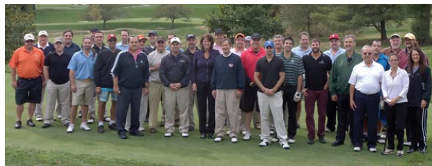
All of the AHI Golf Tournament Participants.