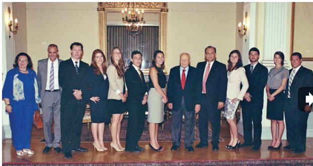
Meeting with President of Greece, Karolos Papoulias.