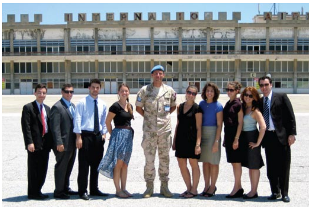
Visit to the old Nicosia Airport, accompanied by a member of the U.N. Peacekeeping force.