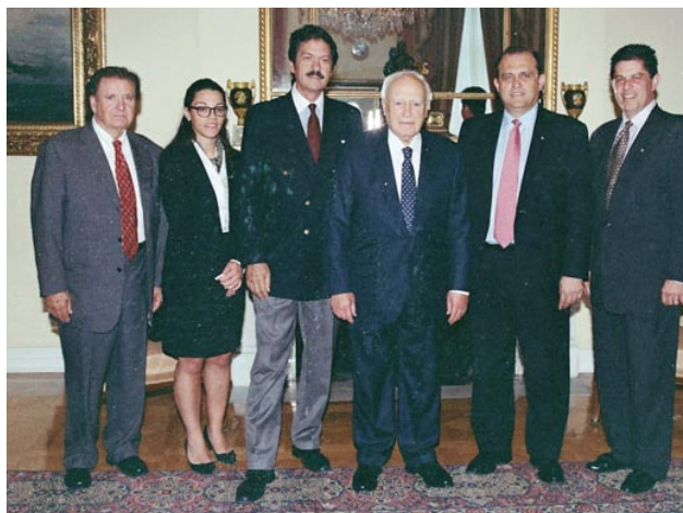
AHI delegation with President of Greece Dr. Karolos Papoulias.

An AHI delegation successfully completed the organization's annual leadership trip to Greece and Cyprus where it held substantive meetings with high-ranking government and religious officials and business leaders with the purpose of strengthening relations and addressing issues of mutual concern. The two-week trip, which occurred May 21 to 31, 2012, also included a leg to Israel.