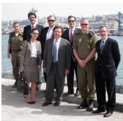
AHI delegation at Israel Defense Naval Base in Haifa.

An AHI delegation successfully completed the organization's annual leadership trip to Greece and Cyprus where it held substantive meetings with high-ranking government and religious officials and business leaders with the purpose of strengthening relations and addressing issues of mutual concern. The two-week trip, which occurred May 21 to 31, 2012, also included a leg to Israel.