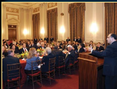
View of the dinner at the Cannon Caucus Room.