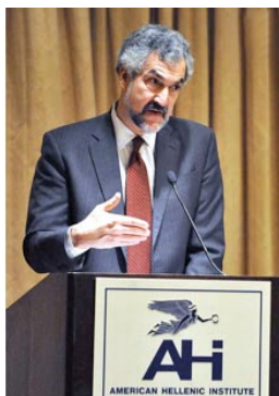
Keynote Speaker Daniel Pipes, President, Middle East Forum and Taube distinguished visiting fellow, Hoover Institution of Stanford University.

AHI hosted the policy forum “The Evolution of Turkey’s Policy in the Eastern Mediterranean: Implications for U.S. Interests” featuring Keynote Speaker Daniel Pipes, president, Middle East Forum and Taube Fellow at the Hoover Institution of Stanford University. Pipes was joined by a panel of experts who examined the topic on February 6, 2012 at the Capital Hilton, Washington, DC.