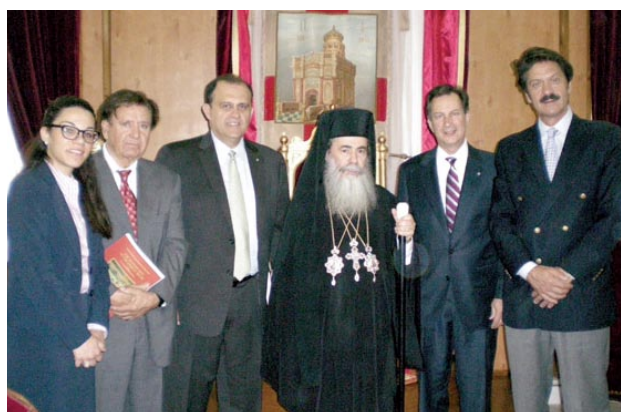
AHI delegation with Patriarch Theophilos III of Jerusalem at the Greek Patriarchate in Jerusalem.

An audience with President of the Hellenic Republic Karolos Papoulias and Greece's Interim Prime Minister Panagiotis Pikrammenos and extensive meetings with the Ministry of Foreign Affairs were highlights of the delegation's busy itinerary in Greece from May 27 to 31. The itinerary also included the 8th Annual AHI Athens Dinner at the Grand Bretagne Hotel on May 30.