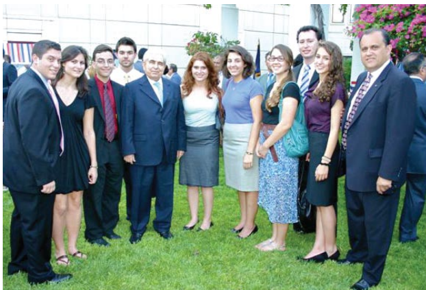
President of the Republic of Cyprus, Demetris Christofias with the students at the U.S. National Day reception at the U.S. Embassy in Cyprus.

The American Hellenic Institute Foundation (AHIF) Foreign Policy Trip to Greece and Cyprus completed its fourth year as nine students from across the United States participated in the two-week program held June 13-29, 2012.