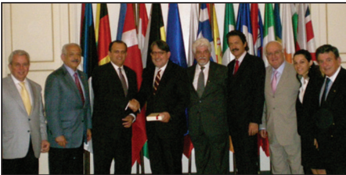
AHI Delegation in Greece with Demetri Dollis, Deputy Minister of Foreign Affairs