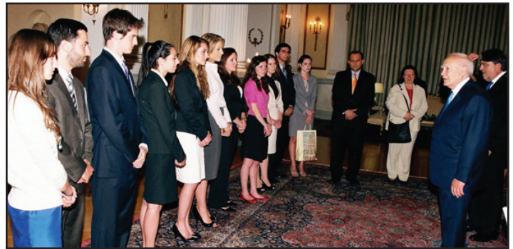
AHI student delegation with the President of Greece, Karolos Papoulias

For the third year in a row, the American Hellenic Institute Foundation (AHIF) College Student Foreign Policy Trip to Greece and Cyprus took place from June 8-23, 2011. Thirteen students from across the United States participated. They received first-hand experience about the foreign policy issues affecting Greece and Cyprus, relations with the U.S., and the interests of the U.S. in the region. The trip began with briefings in Washington on June 8-10, followed by a series of policy briefings and cultural activities in Cyprus from June 12-16, and in Athens from June 17-23.