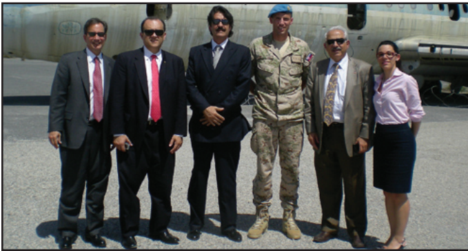
AHI delegation in Cyprus with UN Mission's to Cyprus Communication Officer at the old airport in Nicosia