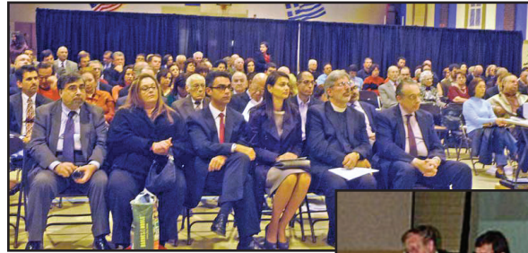
Screening of Cyprus Still Divided: A U.S. Foreign Policy Failure at St. George Greek Orthodox Church in Hamilton, NJ