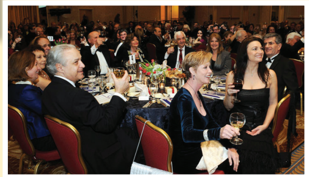
Guests at the 36th Anniversary Awards Dinner

The American Hellenic Institute (AHI) hosted its 36th Anniversary Hellenic Heritage Achievement and Public Service Awards Dinner, March 12, 2011 at The Capital Hilton, Washington, D.C.