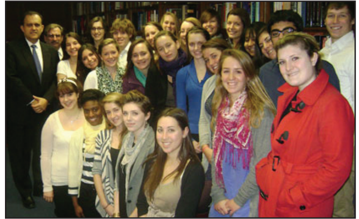
Students from American University's International Relations and Conflict Resolution Program visit AHI