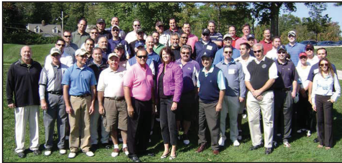
Participants gather before teeing off in the 8th Annual AHI Benefit Golf Tournament