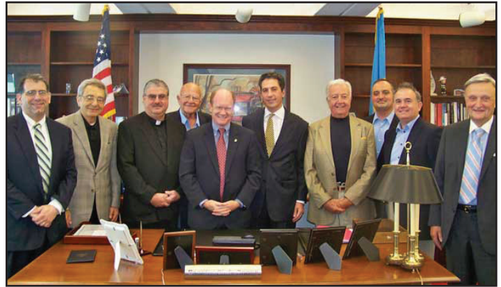
AHI Delaware members and constituents share a moment with Senator Chris Coons (D-DE) following their June meeting