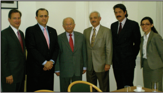
AHI delegation in Cyprus with Presidential Commissioner George Iacovou