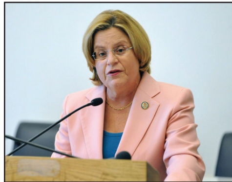
Rep. Ileana Ros-Lehtinen (R-FL) Chair, House Foreign Affairs Committee

AHI observed the 37th anniversary of Turkey's illegal invasion of the Republic of Cyprus by hosting a congressional briefing to discuss the current state of affairs on the island on Capitol Hill, July 13, 2011.