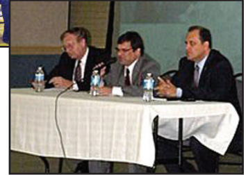
Rep. Gus Bilirakis (R-FL) participates in a panel discussion following a screening in Clearwater, FL.