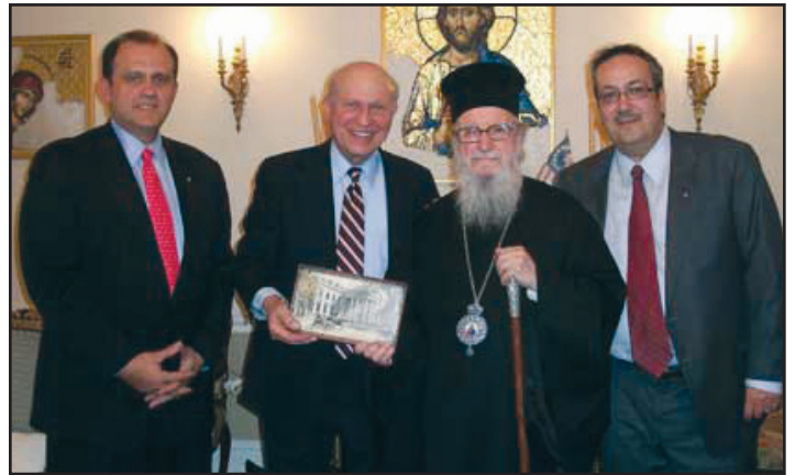
Leaders of AHI and AHIF present his Eminence Archbishop Demetrios with a gift following their meeting