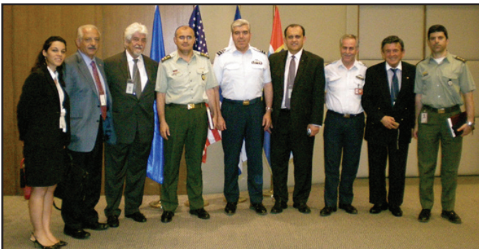
AHI delegation in Greece at the Ministry of Defense

An AHI delegation successfully completed the organization's annual leadership trip to Greece and Cyprus from May 22 to June 2, 2011. The two-week trip aimed to strengthen relations with both countries and to work on issues of mutual concern through substantive meetings with high-ranking government and religious officials, and business leaders.