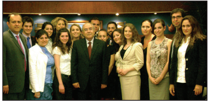
Student delegation with Honorable Yiannakis Omirou, President of the Cyprus House of Representatives