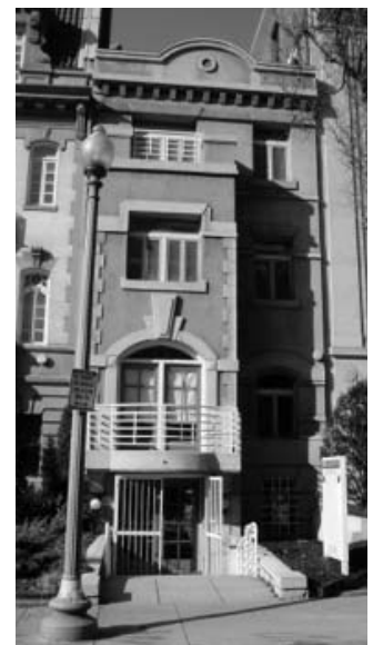
AHI is headquartered at Hellenic House on 16th Street in Washington, just a few blocks up the street from the White House.